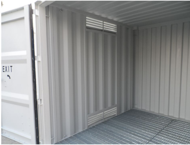
Interior View (Left Side)