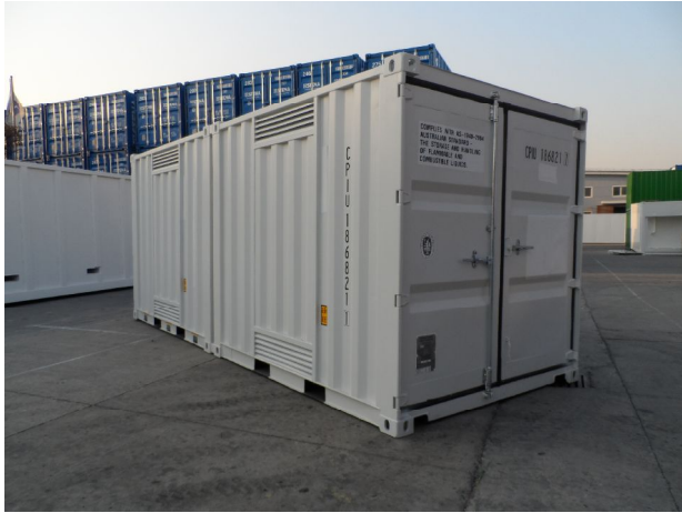
End Door View (1)