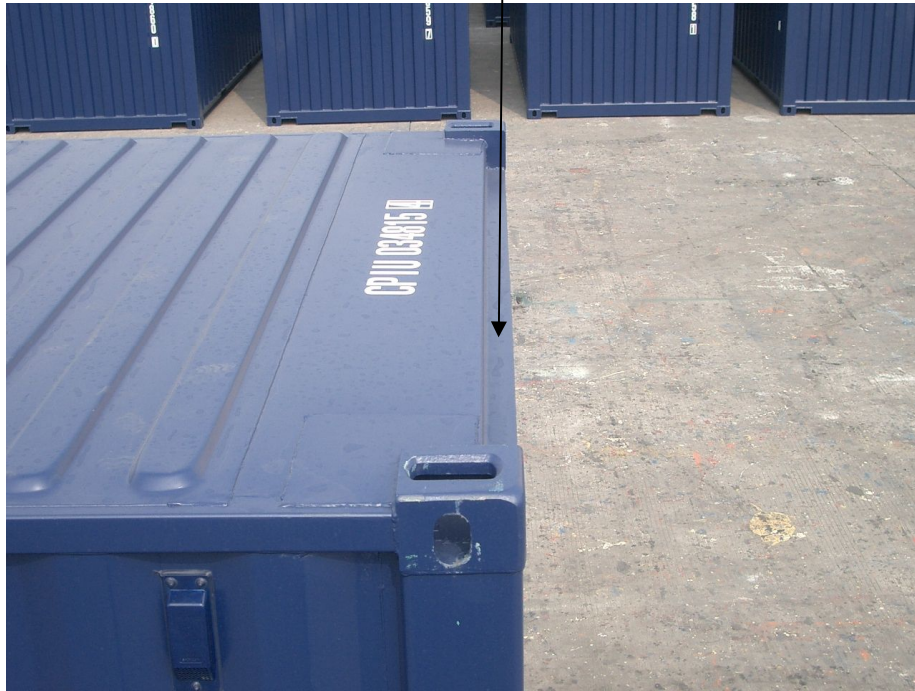
Bottom Side Rail (Double “Z” Section)