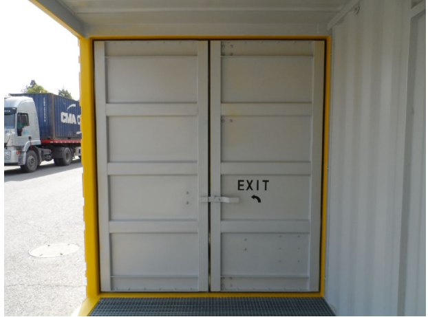
Interior Rear End Door