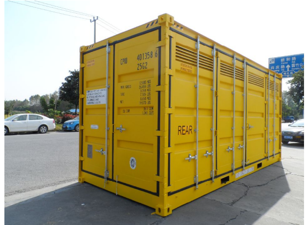
View in 45 Degrees(2)