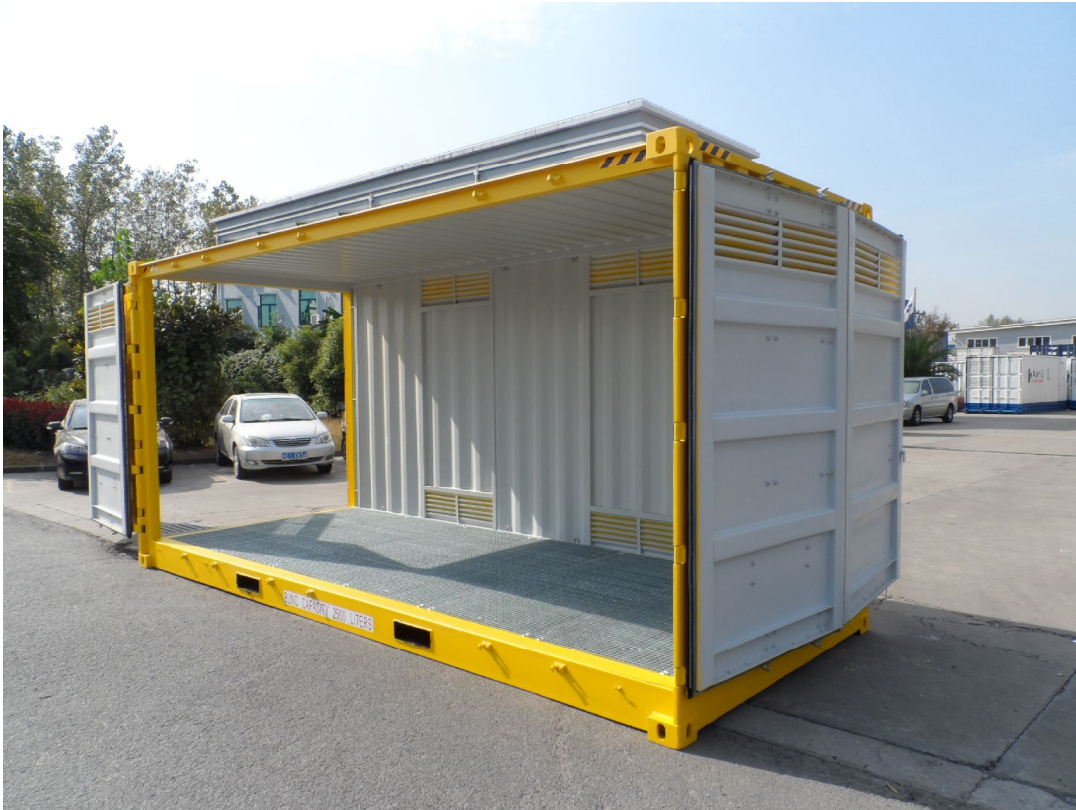
Steel Grid Floor