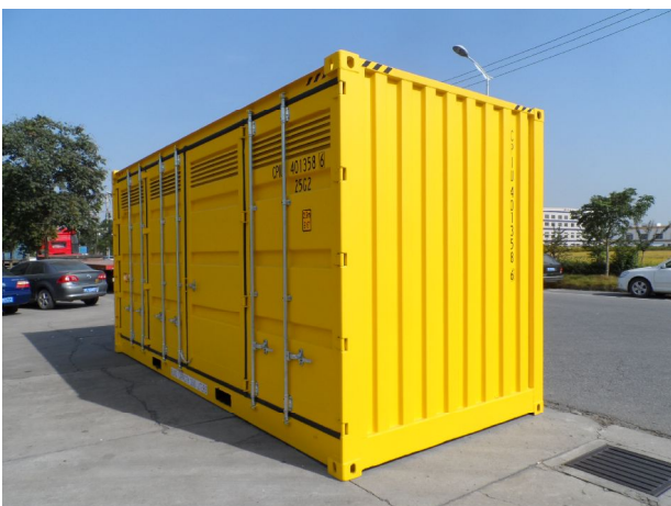
View in 45 Degrees (3)