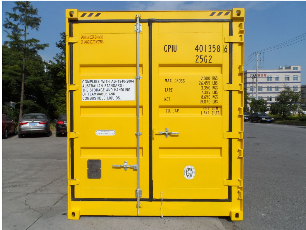
Front End Wall