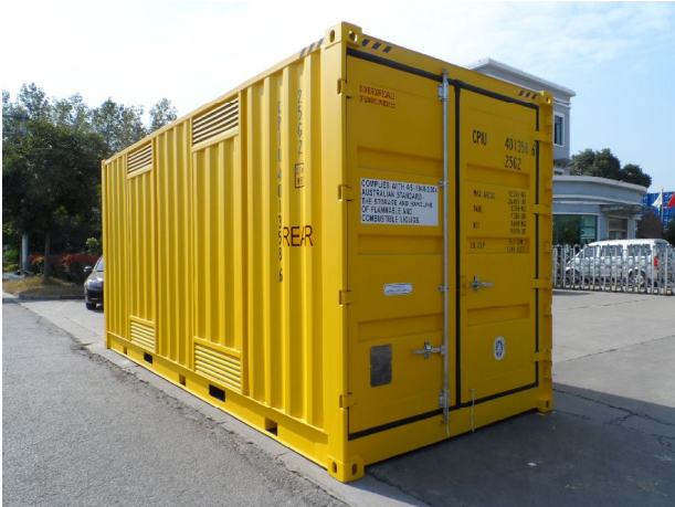
View in 45 Degrees (1)