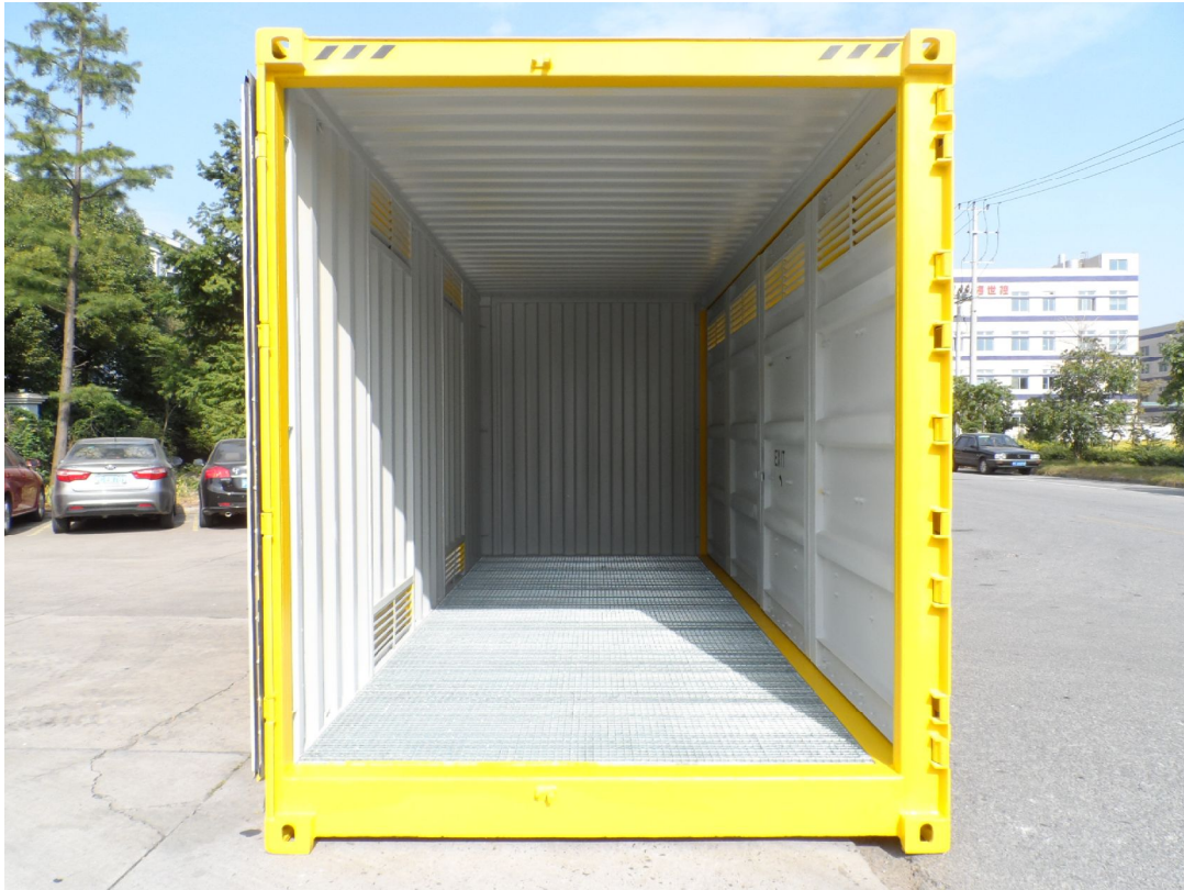
Side Door Open With 270 Degrees