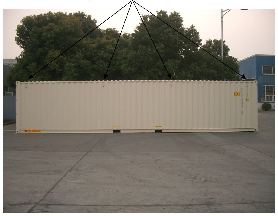
Side View (With "REAR" Decal)