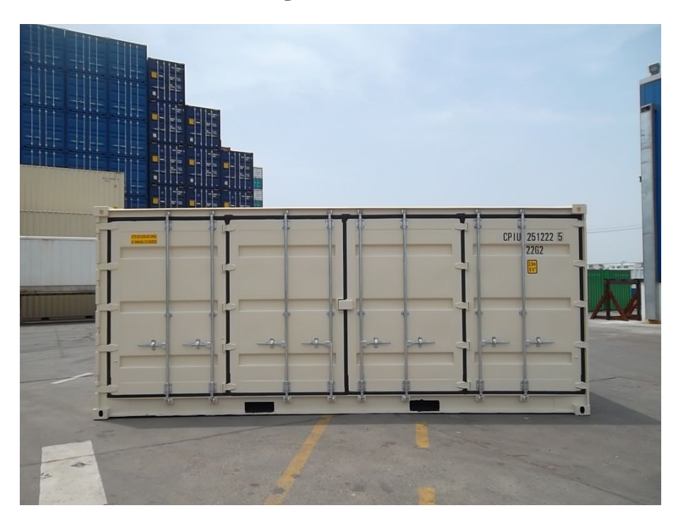
Left Side Doors