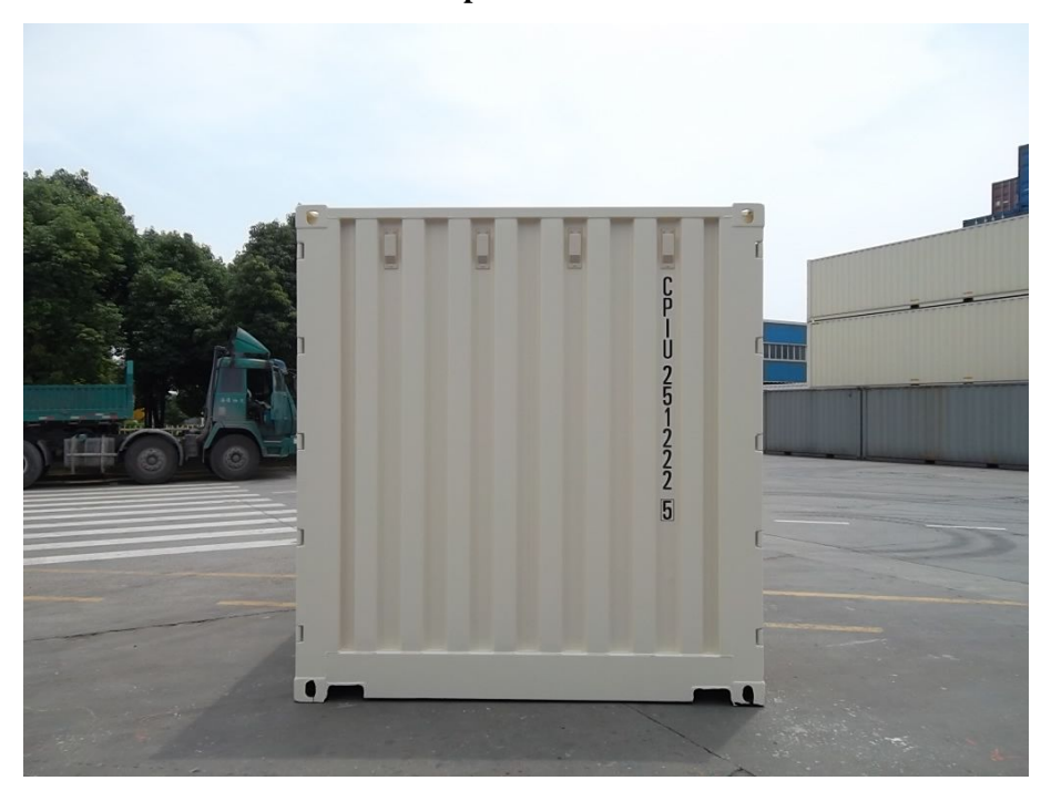
Rear End Door