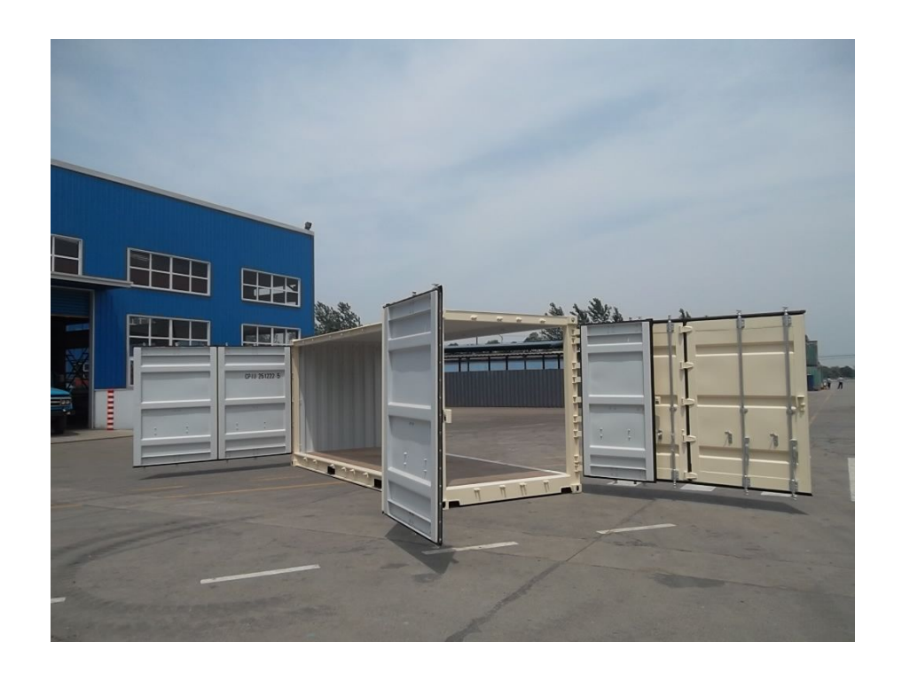
Two Middle Side Doors Open