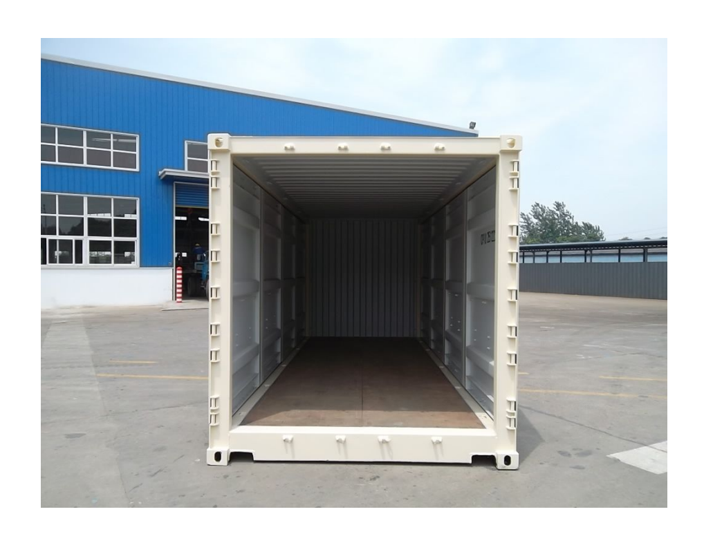
Both Side Doors Open (270 Degrees)