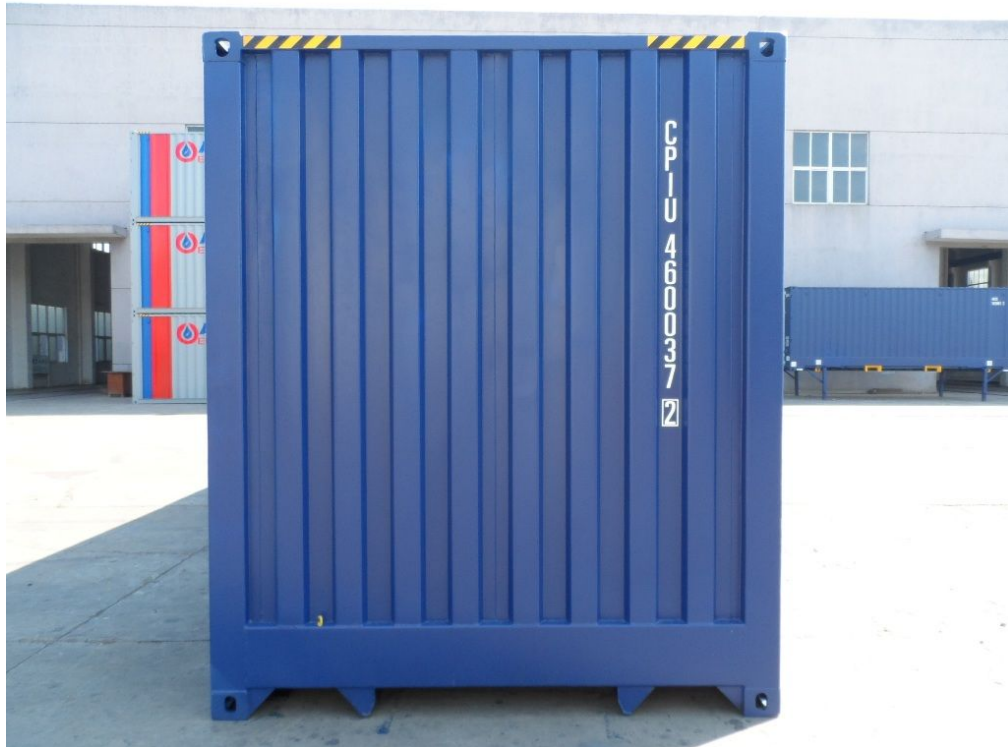
Rear End Door