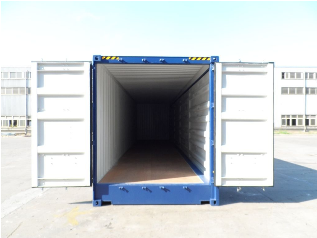
All Side Doors Open With Full Side Access (180 Degrees)