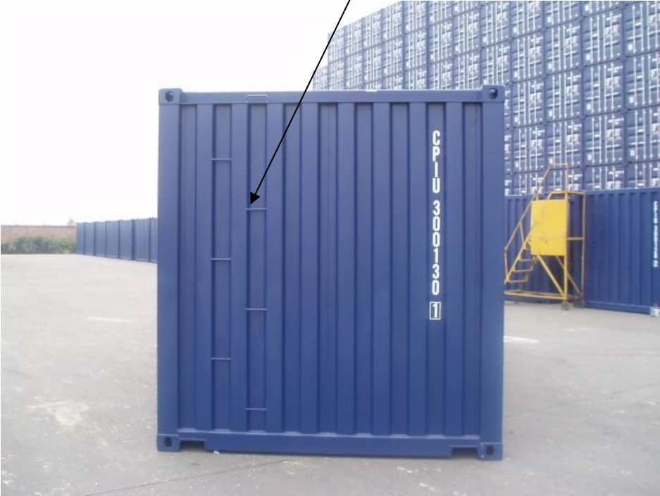
Rear End Door