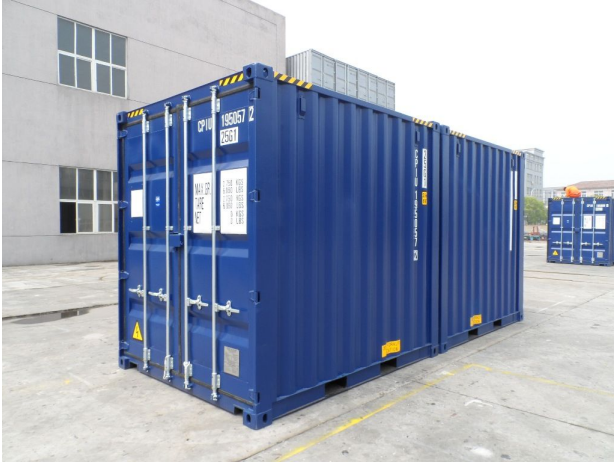
End Door View (1)