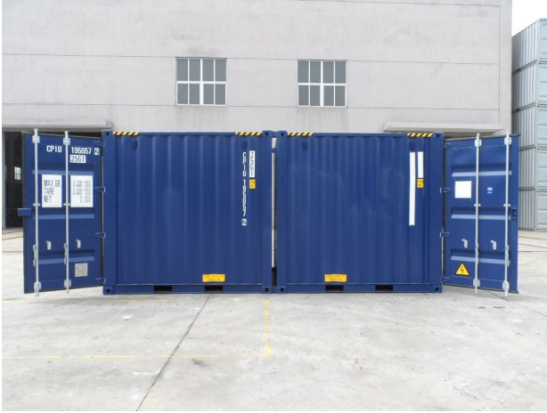
Both End Doors Open