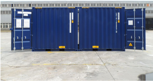
Both End Doors Open