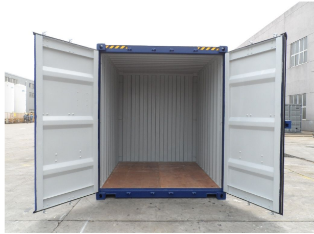
10'HC Doors Open